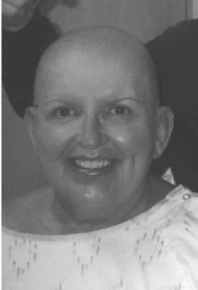
Here I am, bald, in March 2002.

I was healed using Adult Stem Cells (my own). I AM the success story.